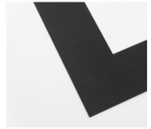
Black / Black Core